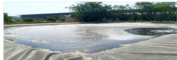
Fig. 2. Leachate collection site (Solar Evaporation Pond)