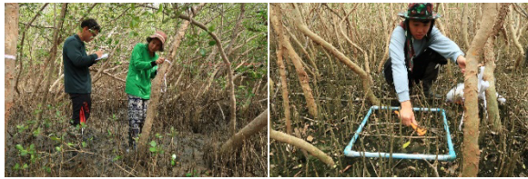
Fig. 2. Mangroves sampling

pling was done with a core sample using the adapted 20 cm diameter. The Six parameters have been measured in the soil were temperature, pH, bulk density, texture, available phosphorus and available nitrogen as the methods water and wastewater set by Thailand's Pollution Control Department.