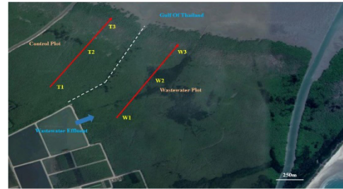
Fig. 2. Collection area

tions according to the tide level. To sum up, there are six stations: (i) three stations in the control transect (T1, T2, T3), (ii) three stations in the transect treated by the wastewater (W1, W2, W3), as presented in figure 2. The sampling parameters selected are 1) Soil sampling 2) Water sampling and 3) Mangroves samplings. (Orathai, 2014)