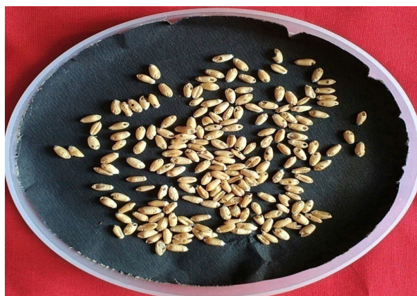
Damaged seeds by sitophilus oryzae

Procedure: The wheat seeds of each variety were properly cleaned to remove the fractions or insects, after that the seed material was sealed in polythene bags to kept the seed material air tight conditions, Later, these seeds of each variety were kept in deep freezer at -20 °C for 72 hours to make them free from insects and after removing from the freezer these seeds were conditioned at least for a week,