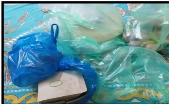
Fig. 1. Polythene in residential areas

ecosystems. Many methods were developed to degrade the harmful plastic further more research is