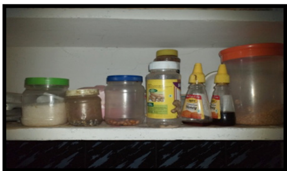
Fig. 2. Plastic bottles