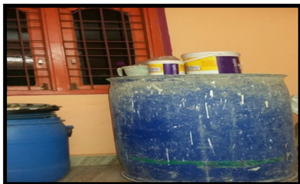
Fig. 5. Plastic tubs

required to reduce plastic pollution in and around the world. Plastic waste degradation by microbes is ecofriendly approach and it won't create any harm to the nature. Recycling and reduction of plastic waste can reduce pollution. Creating mass awareness in the society can attain sustainability. Plastic pollution is ever lasting so to curb plastic pollution people should take individual responsibility and use ecofriendly products.