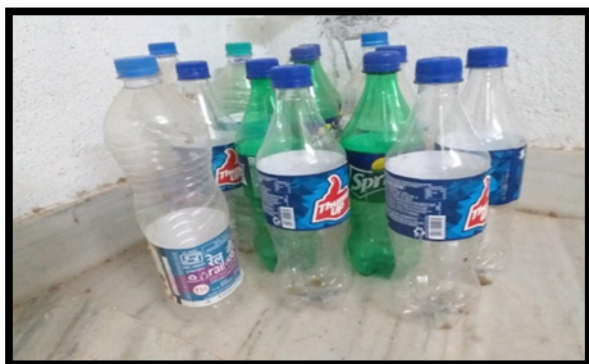
Fig. 3. Plastic cool drink bottles