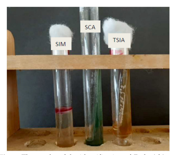
Fig. 2. The results of the identification of Escherichia coli bacteria on Sulfide Indol Motility (SIM), Simons Citrate Agar (SCA), and Triple Sugar Iron Agar (TSIA) media

tetracycline and ciprofloxacin. The sensitivity test showed that 40 samples (67%) were resistant to ciprofloxacin antibiotics, 39 samples (65%) were resistant to tetracycline antibiotics, 22 samples (37%) were resistant to gentamicin antibiotics, 14 samples (23%) were resistant to chloramphenicol antibiotics, and 2 samples (3%) were resistant to aztreonam antibiotics.