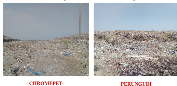
Fig. 1. Sample Collection Site

The soil samples were collected from the waste dumping yard of perungudi and chrompet, Chennai, Tamilnadu, India. The soil was collected aseptically in clean sterilized containers without any contamination in it. The collected samples were straight away transferred to the laboratory in an ice box for bacteriological examination Fig. 1.